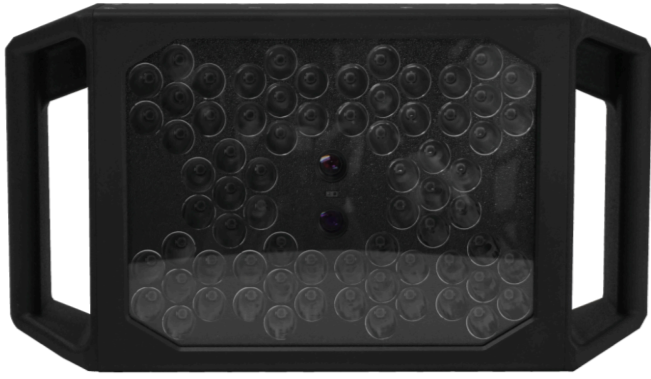
Rear view of the BlackMobile V2 with LED broadband illumination